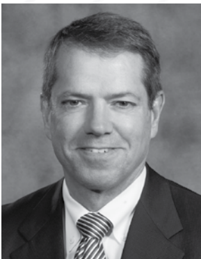
Jim Pillen Columbus