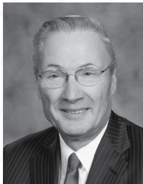
Hal Daub Omaha